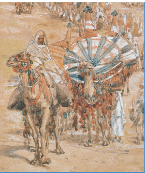
Movement • Abraham led his household into the land of Canaan. ▲