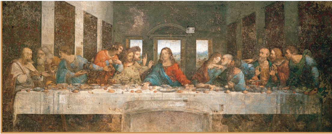
Culture • This famous painting, The Last Supper by Leonardo da Vinci, shows Jesus with his disciples shortly before his death. ◀