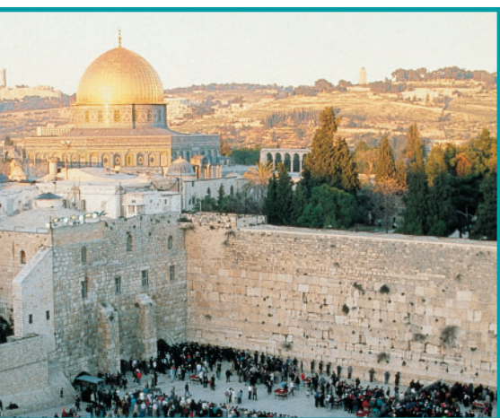
Place • The Wailing Wall is all that remains of Solomon's Temple. ▲